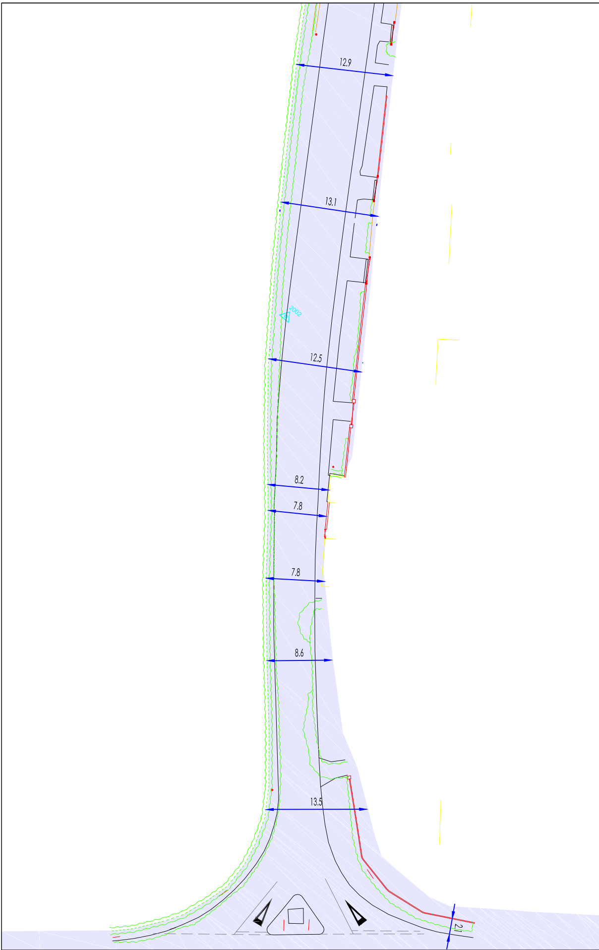
SOUTHERN SECTION OF COLLEGE ROAD SOUTH