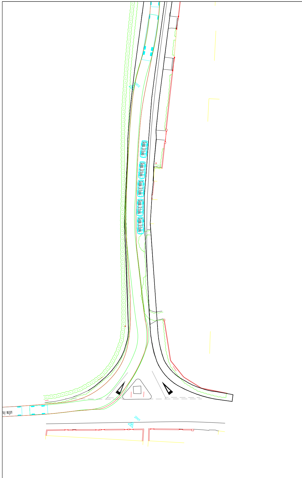
TRACTOR AND HAY WAGON MOVING NORTH ON COLLEGE ROAD SOUTH